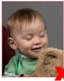
Eyes not open/toy visible