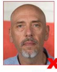
Background not plain