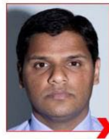
Shadows on image and background