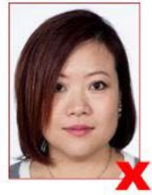
Hair obscuring face