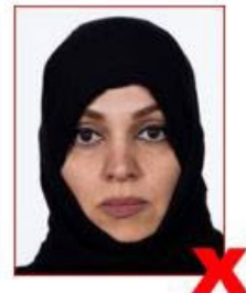
Eyes/edges of face obscured