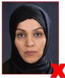
Background too dark