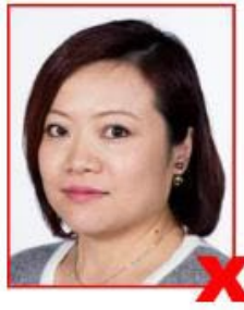
Side on to camera